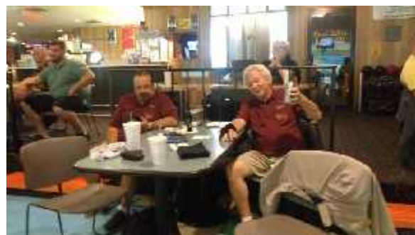
Here he is our Worthy Financial Secretary showing why we really come to bowl.